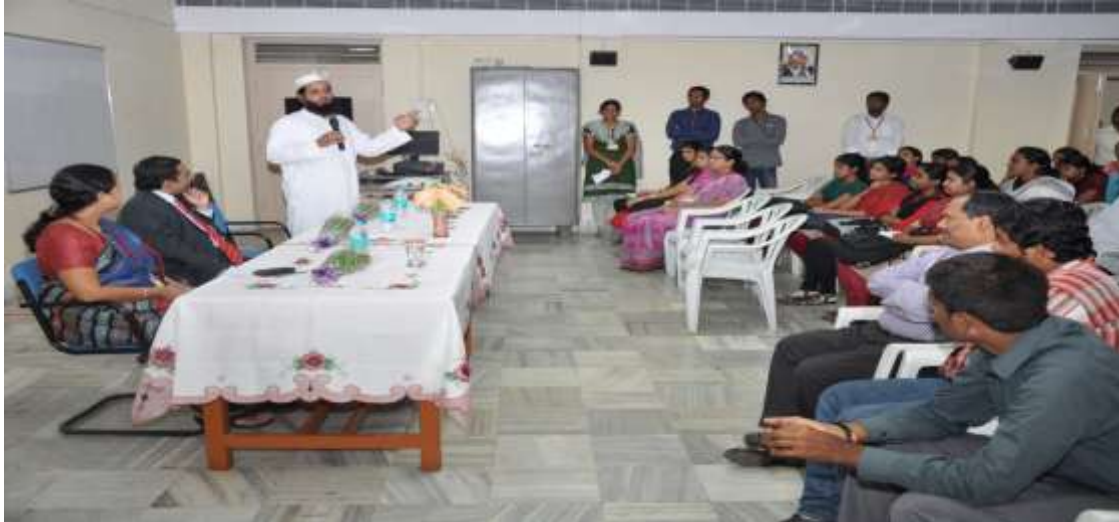
Snapshot at android NDAC-2k13 inaugural function