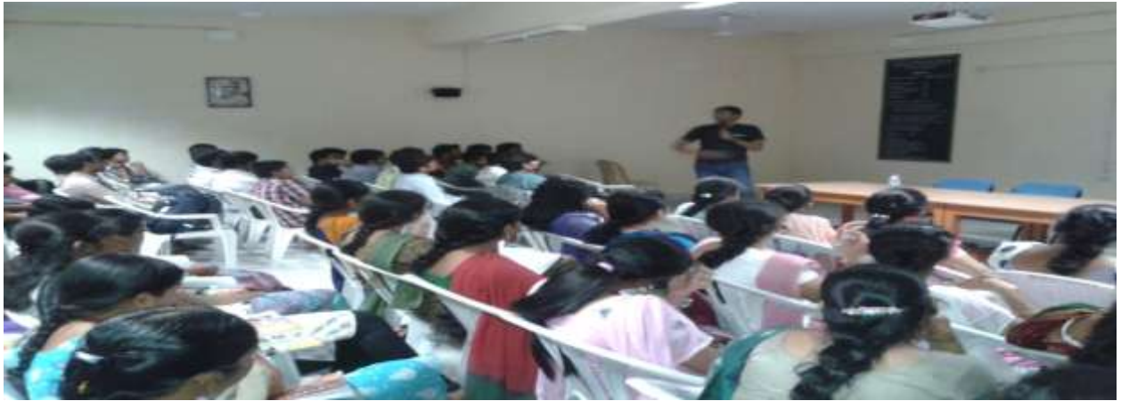
Snapshot of the presentation at the seminar