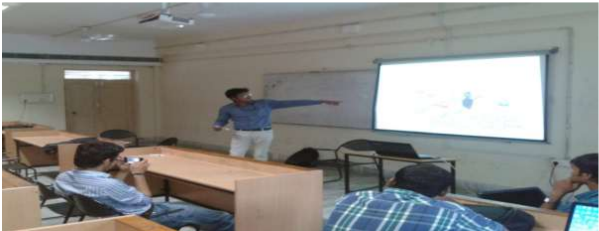
Snapshot of the presentation at the seminar