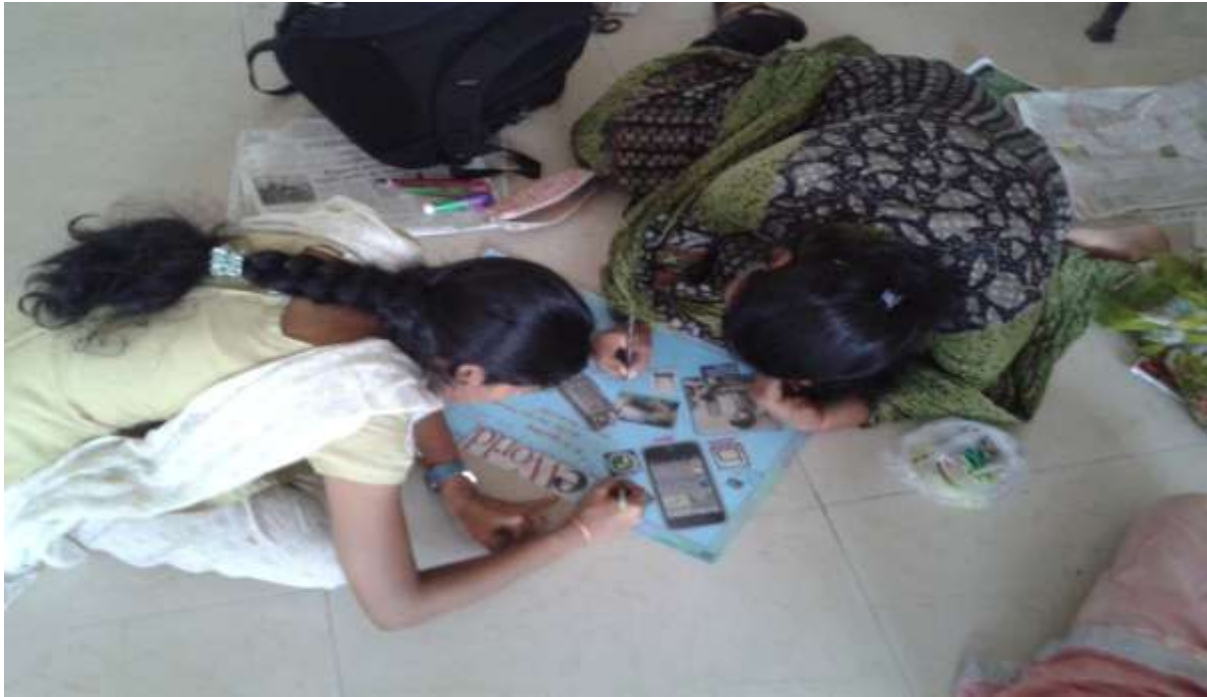
Snapshot of Techno Collage