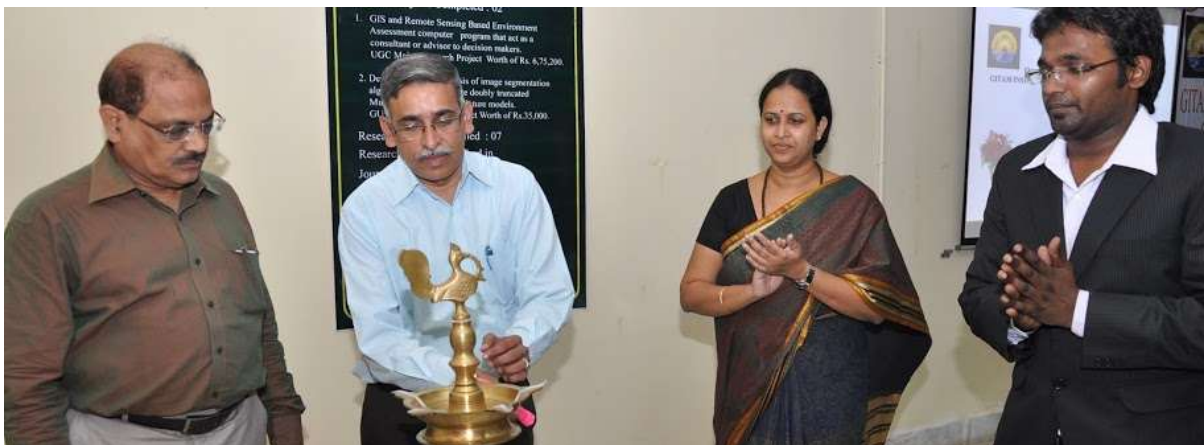
Snapshot Lighting the lamp at inaugural function

The vote of thanks to all the dignitaries, management, supporting members and student members was delivered and the meet was concluded after the National Anthem.