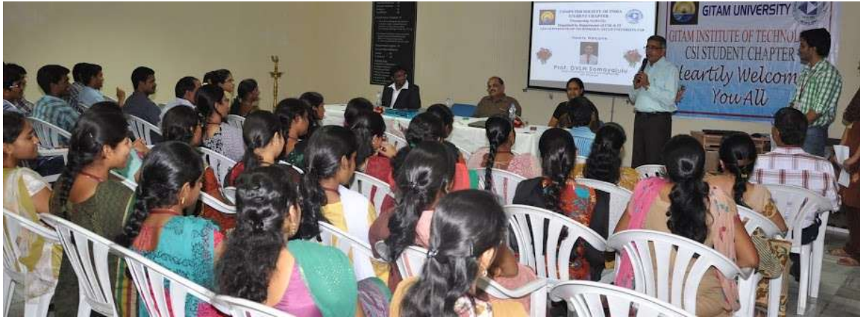
Snapshot Technical talk on BIG DATA being addressed by the chief guest at inaugural function