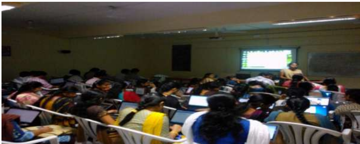
Snapshot of the presentation at the workshop